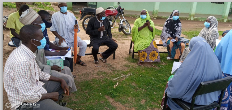
Photo credit: Breakthrough ACTION Nigeria Fostering Collaboration and Learning while Addressing Barriers to Uptake of Maternal Health Services in three Northern States in Nigeria. 2022