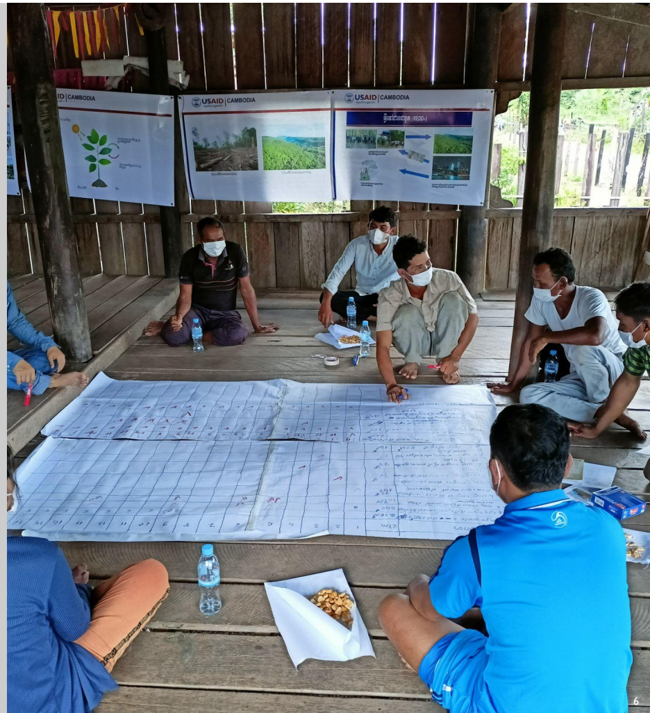
Photo credit: Greening Prey Lang “Adaptive Management & Openness Guide the Redirection of the Greening Prey Lang Activity in Cambodia” 2022

Note: The specific activity doesn't necessarily have to be funded by USAID; USAID must somehow be connected to the work.