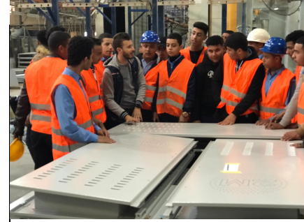
Youth during a practical session of entreprenureship work-based learning during USAID/Egypt Workforce Egypt Project Training