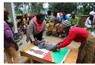
A Caritas Rwanda Nutrition Officer and Community Volunteer check a child's nutritional status during a joint supervision visit in the Burera District of Rwanda to learn from and continuously adapt the USAID-funded INECD project.