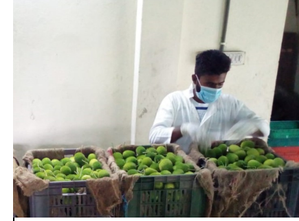
Spine gourds are sorted and graded at the local Collection Centre in Jashore .