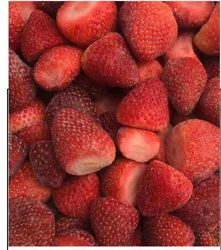
Frozen strawberries exported by USAID TRADE-supported SME.