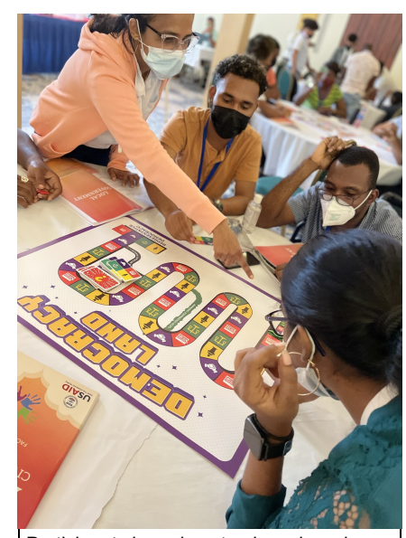
Participants learn how to play a board game from the IFES Youth ALLIES civic education toolkit during a training.