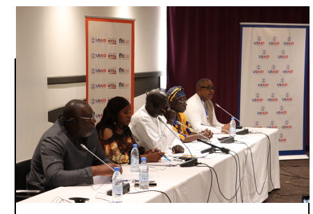
Panel of country representatives discussing sustainability and country ownership during the 2-day Act | West Pause & Reflect session.