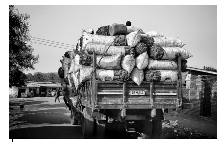
"A Typical Example of a Vehicle Openly Transporting Illegal Charcoal before USAID/UKAid Support to Improve Forestry Regulation and Law Enforcement".