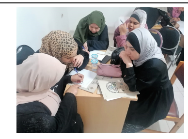
Participants engaging in the USAID Recycling in Jordan Waste Pickers Training Program.