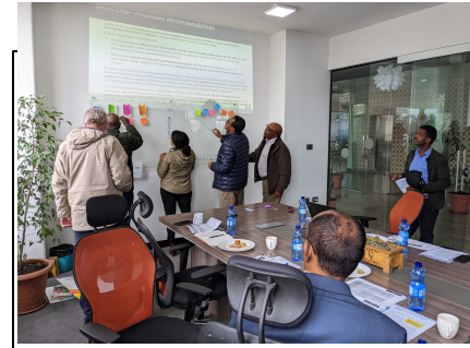
Participants from a USAID/Ethiopia Implementing Partner organization engage in a Headlight-facilitated Adaptive Action Planning Workshop.