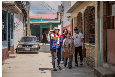
Sembrando Esperanza surveyors at work in Choloma, Honduras.