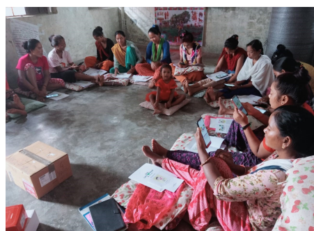
Caregivers learn EdTech Apps during the digital learning workshop funded by World Vision's Accelerator Fund.