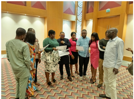
ICHSSA1 team members discussing CLA maturity during the annual retreat.