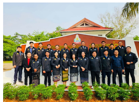
Lao higher education leadership.