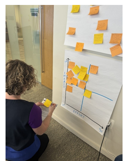
Participant places a potential learning question along the Impact vs. Effort Grid during the GH PEARL in-person partners' meeting.