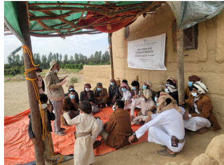
Community engagement meeting to address healthcare challenges in Al-Jawf governorate, Yemen.