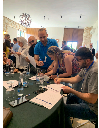
PAJ team collaborate during a team-building retreat centered around CLA.