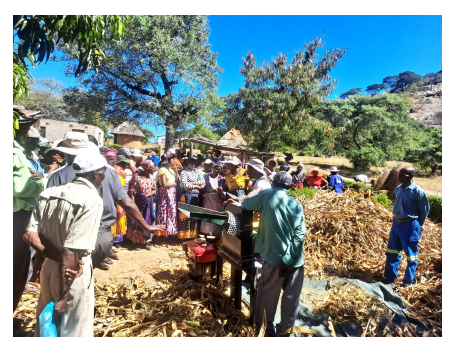
Farmers during the mechanization demonstration where the Mechanization & Extension Activity and Fostering Agribusiness for Resilient Markets (FARM).