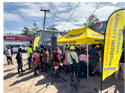
PNG residents learning about and registering for new accounts offered by MiBank.