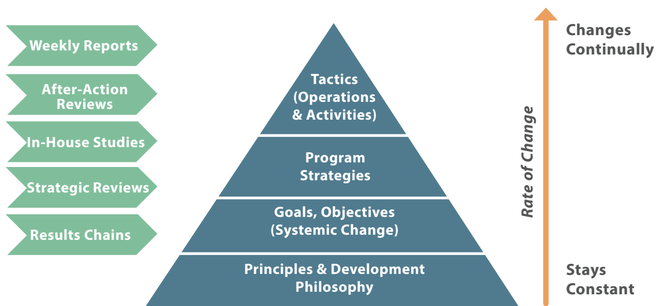
Figure 1 - Tools and processes must support reflection and learning at all levels of the program: from day-to-day operations to higher-level theories-of-change

The foundational culture at GHG – of investigation, debate, and experimentation – has been supported by a broad set of tools and processes. These tools and processes support adaptation at every level of programming: conceptual to tactical. Tools such as weekly reports and after-action reviews enable reflection and learning in staff's day-to-day. Others, such as results chains and strategic reviews, support reflection on the underlying hypotheses in the program's theory of change (see Figure 1).