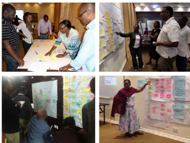
Figure 1. Evaluative thinking workshop participants creating and analyzing theory of change models.

Below, we describe in detail the workshops we facilitated through this pilot program; since they appear to be the first ECB workshops of their kind—intentionally and explicitly focused on promoting ET among diverse community education and development volunteers and professionals—we hope that our experiences with and research on this ET promotion approach can contribute to related ECB efforts in other contexts. We also share some images of the workshop participants in action as they practice ET with ToC models and other tools to work with assumptions (see Figure 1).