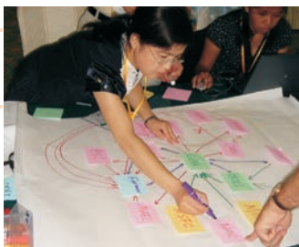
(i) Drawing a network map