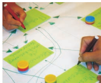
(ii) Placement of influence towers and drawing of 'smiley' faces to indicate stakeholder attitude to the project

Day 3: Developing the outcomes logic model and an M&E plan In the final part of the workshop, participants distil and integrate their cause-effect descriptions from the problem tree with the network view of project impact pathways into an outcomes logic model . This model describes in table format (see Table 1) how stakeholders (i.e. next users, end users, politically-important actors and project implementers) should act differently if the project is to achieve its vision. Each row describes changes in a particular actor's knowledge,